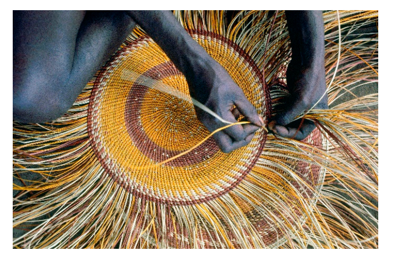
Figure 4. Traditional weaving in the Tiwi Islands.

'Because Country and culture is connected and spiritual connection, passing on of knowledge is connected to country and culture ... And your identity ... And family ... [and] ... education.' (Participant, Tasmania, Major City)